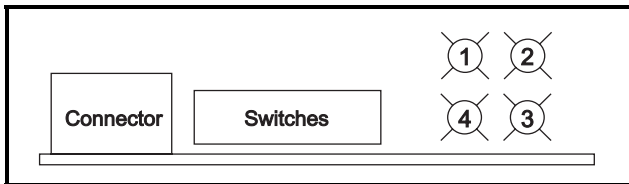
FIGURE 2.2 LED Indicators.

The module contains four LED indicators.